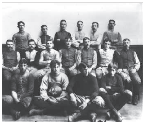
The 1893 football team - the first at Oregon State.