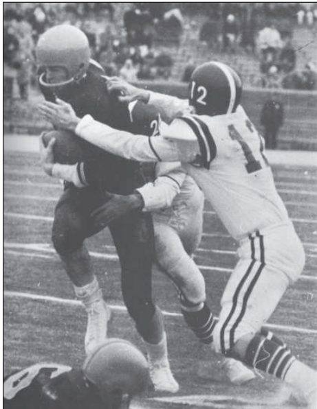
In the 1962 Liberty Bowl, Terry Baker raced 99 yards for the game's only score. Baker went on to earn All-America accolades and the Heisman Trophy.