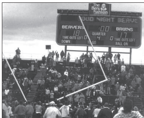
The Beavers defeated UCLA in 1989, 18-17, on national television prompting the fans to tear down the goalposts.