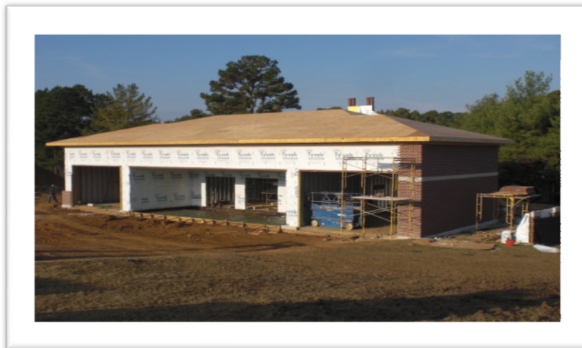
Herrington Golf Center - December 1, 2011 prior to completion. Two video bays on each side, four hitting areas in the middle of building.

$50 per camper, which includes lunch. You may pay by check or credit card on the day of camp. If we do not have at least 12 campers, we will cancel the camp.