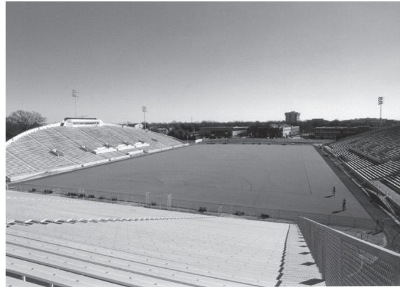
Old Dominion's Foreman Field

Age Requirements: Girls age 13-H.S. seniors Team Requirements: 12 girls per team (minimum)