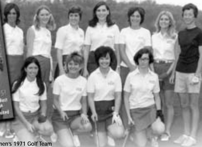
Women's 1971 Golf Team

The following year, competing in their first MAC Championships, the Bobcats finished third.