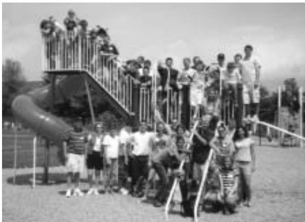
Each spring, members of the Ohio men's and women's golf teams visit children at Morrison Elementary School to teach golf and life lessons.

Last academic year, Ohio placed 226 student-athletes on quarterly Dean's Lists.