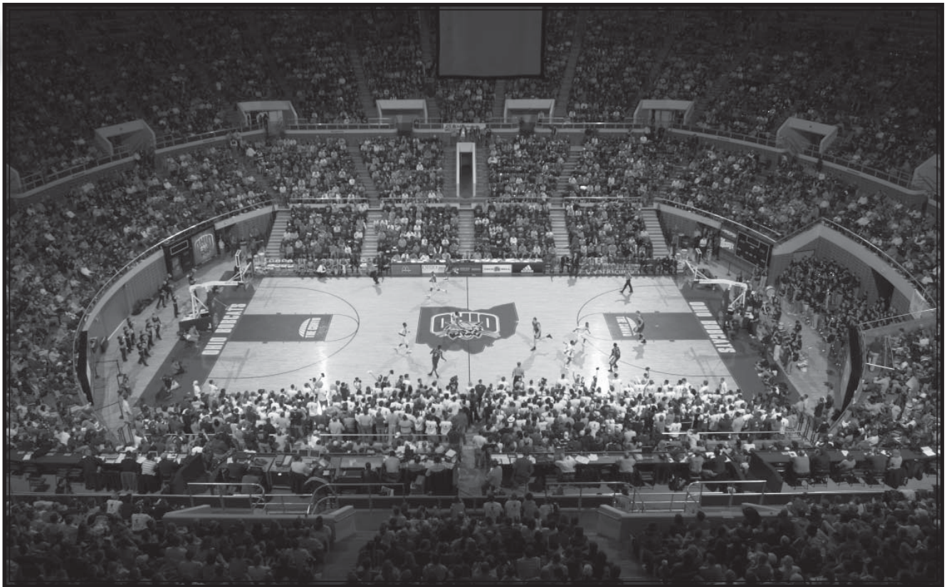
The Bobcats attracted the Mid-American Conference's largest crowd for a league game last year when 10,094 fans crammed the Convocation Center to see Ohio defeat Central Michigan 76-44 on Jan. 14.