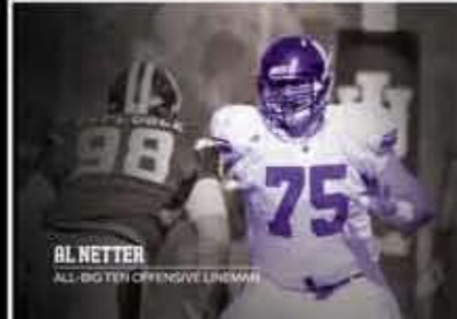
AL NETTER ALL-BIG TEN OFFENSIVE LINEMAN

WILL CALL - Will Call windows for the general public can be found at the Athletic Ticket Office next to Gate K.