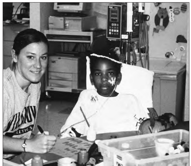
Villanova student-athletes are involved with numerous community service programs each year. On a visit to the St. Christopher Children's Hospital the Wildcats and patients painted pumpkins and made masks for Halloween.