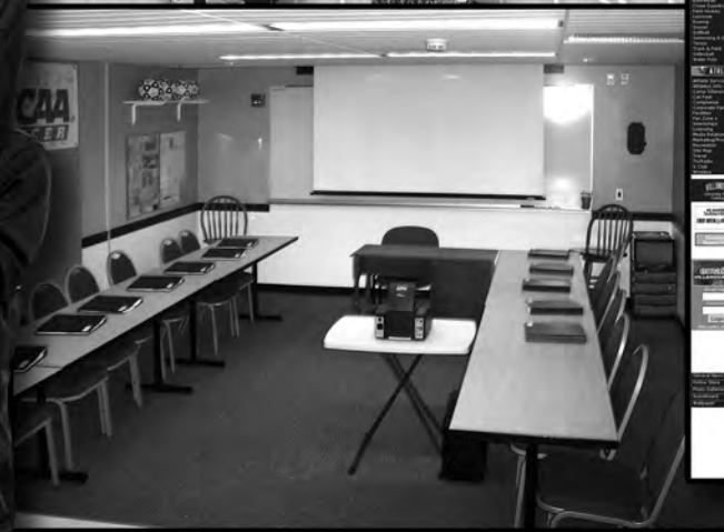
West Campus Meeting Room