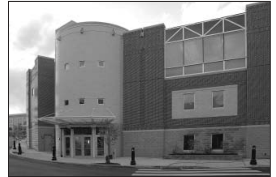
Davis Center for Athletics and Fitness