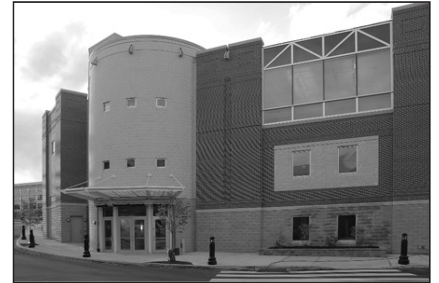
Davis Center for Athletics and Fitness