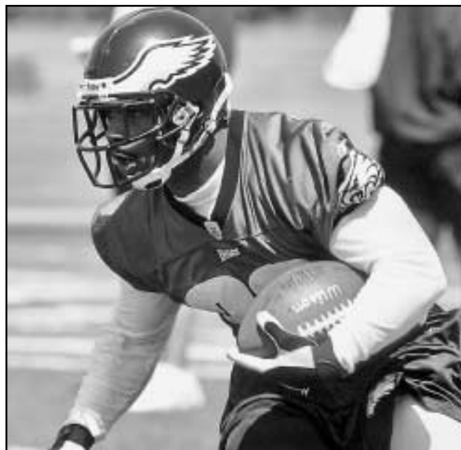
Former Wildcat student-athlete Brian Westbrook is currently a member of the NFL's Philadelphia Eagles.