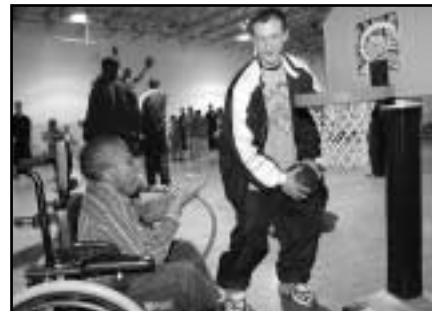
Villanova student-athletes visit children at the Don Guanella School for mentally challenged kids.

The objective is to help those in need and instill in the athletes the need to help others.