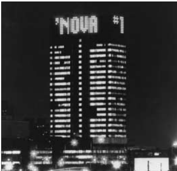
When Villanova's men's basketball team won the 1985 NCAA Championship, the City of Philadelphia celebrated the victory. Here, the headquarters of Philadelphia Electric Company showed how the Wildcats ranked.

Villanova University joined the Big East Conference in men's sports in the 1980-81 academic year. The Big East Conference added women's sports in the 1982-83 academic year.