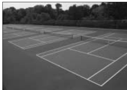
West Campus Tennis Courts

A brand new tennis facility was constructed on Villanova's West Campus during the summer of 1999. This new facility is home to both the Wildcat men's and women's tennis teams. Recreational courts are also available on the South Campus adjacent to Stanford Hall, and on the Main Campus behind Kennedy Hall. As part of the West Campus construction, new locker rooms will also be added to the facility.