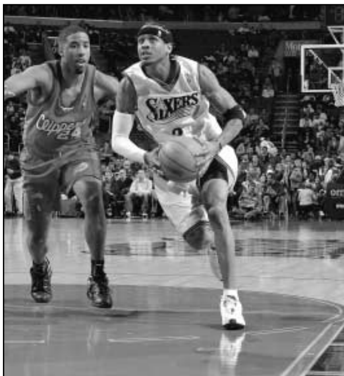
Allen Iverson and his 76er teammates play their home games at the beautiful Wachovia Center.