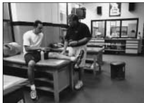
Athletic Training Room

Villanova's Jake Nevin Field House features a full-service athletic training room. The facility contains state-of-the-art equipment specifically for the treatment and rehabilitation of athletic injuries. This facility now contains 2,200 square feet of training space. All advanced treatment and rehabilitation is performed under the supervision of four full-time National Athletic Training Association Certified personnel. In the cases requiring physical therapy needs, or subspecialized medical evaluation, outside consultants are utilized.