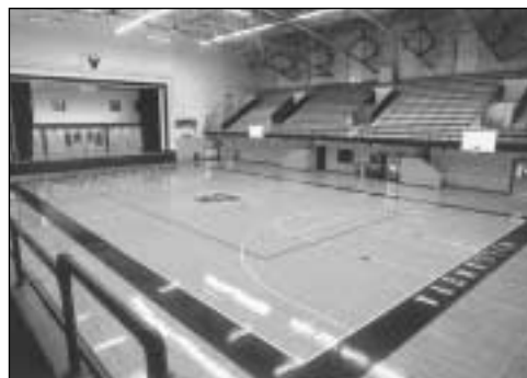
The Jake Nevin Field House