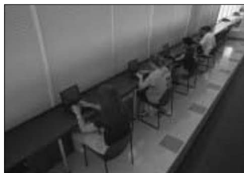
Academic Resource Center