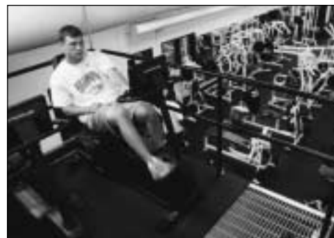
Villanova Stadium Weight & Conditioning Center

Under the direction of Strength & Conditioning Coach Jeff Watson, Villanova University offers one main weight training & conditioning facility underneath Villanova Stadium for all Wildcat student-athletes. Recently, the weight room was renovated to a 5,900 square foot training center with weight training and cardiovascular machines. There are also other weight training and conditioning facilities for the general Villanova University community on the South Campus and the West Campus. The South Campus facility was also renovated in the summer of 1998 to fit the needs of the general student body.