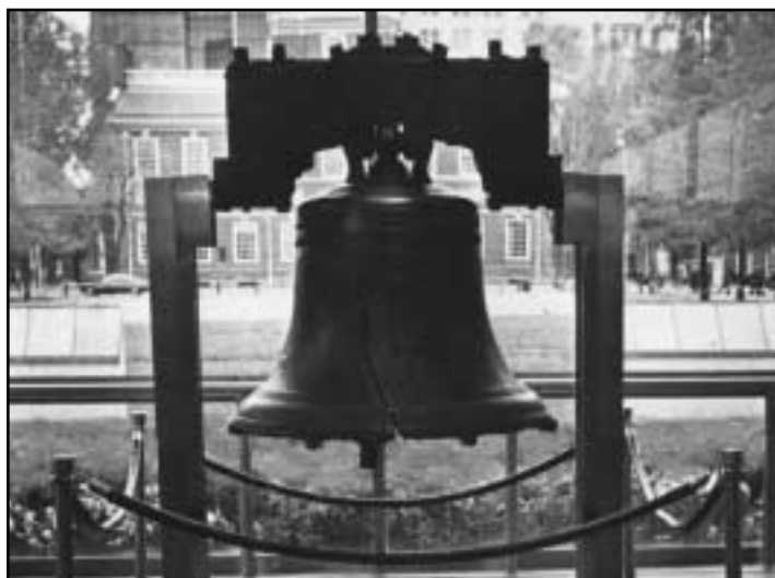
The Liberty Bell is just one of the many tourist attractions that the city of Philadelphia has to offer.