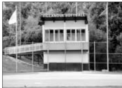
Villanova Softball Field

Located behind Bartley Hall on the Main Campus is Villanova's softball field. In the Spring of 1998, the field was completely refurbished, improving the facility to one of the best in the Big East Conference. Improvements to the field include dugouts, warm-up areas and a new playing surface. To commemorate the opening of the new field, USA Softball Olympian and gold medalist Dot Richardson christened the new field by throwing out the first pitch in the Wildcats' doubleheader with Boston College on April 7, 1997. During the spring of 2001, a press box was added to the Villanova Softball Field and was host to the 2001 Big East Softball Championship.