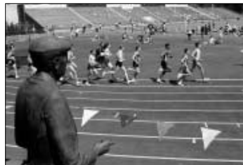
The Jumbo Elliott Track