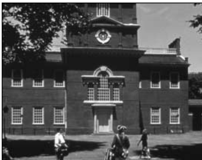
Philadelphia provides Villanova University students with a big city atmosphere.

For information on Villanova University's Athletic Schedules, contact the Athletic Department at 610-519-4090.