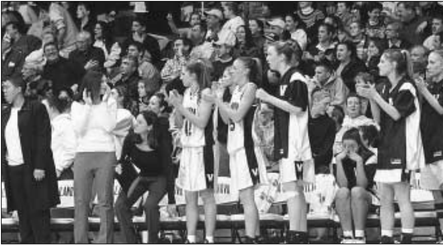
The Villanova Wildcats will be shooting for their fourth straight 20-win season in 2003-04.