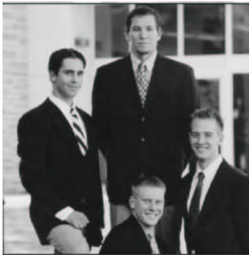
The Men's Swimming Seniors