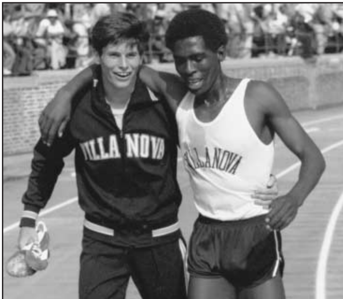
Sydney Maree (pictured here on the right) has five IC4A Indoor Championships to his credit.