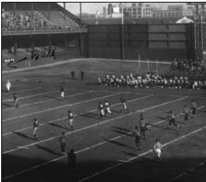
The Villanova/Auburn game held at Shibe Park was a rematch of the 1938 Bacardi Bowl where the Wildcats and Tigers played to a 7-7 tie in Havana, Cuba.