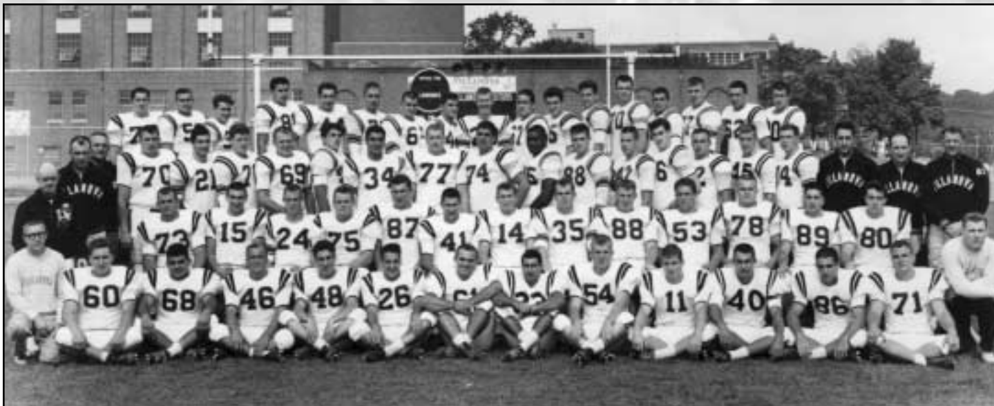
The 1961 Villanova Wildcats defeated the Wichita Shockers in the Sun Bowl played at Kidd Field in El Paso, Texas.

NOVEMBER 22, 1894: Villanova College's first football game, a 24-0 victory over the Logan Athletic Association.