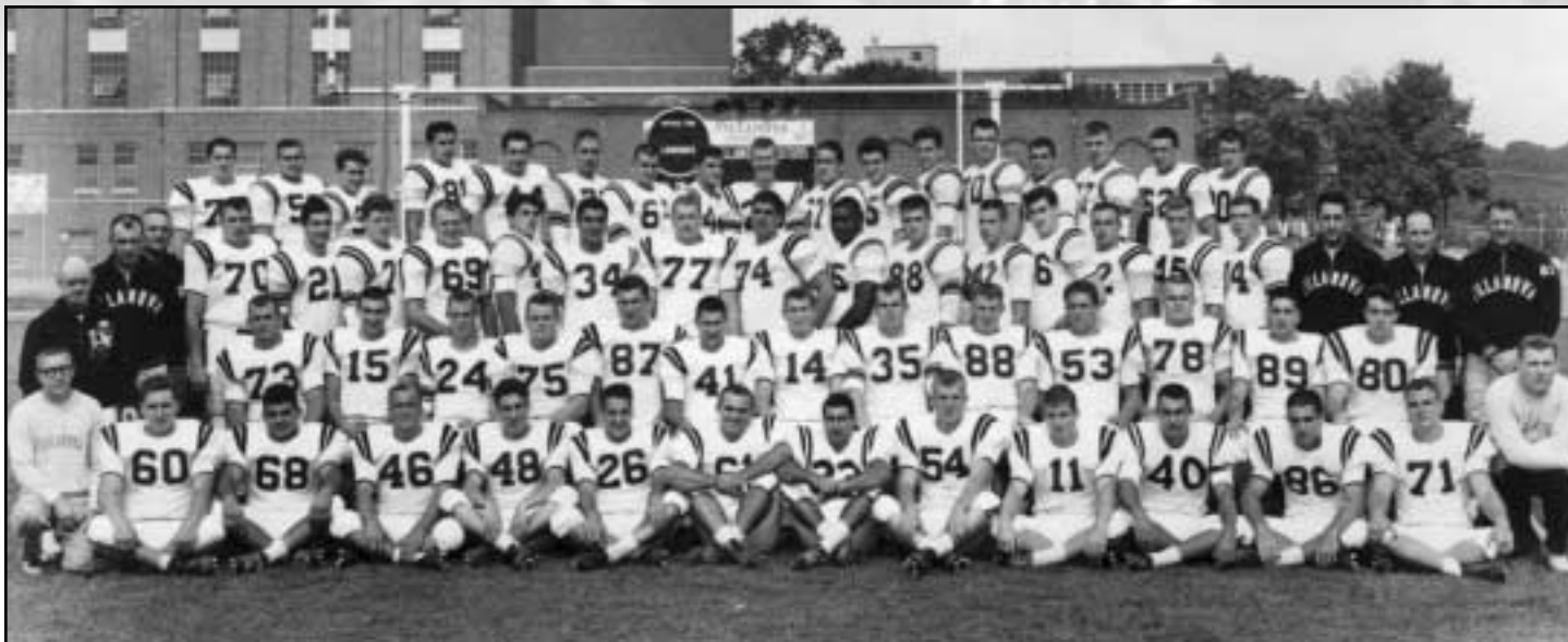
The 1961 Villanova Wildcats defeated the Wichita Shockers in the Sun Bowl played at Kidd Field in El Paso, Texas.

NOVEMBER 22, 1894: Villanova College's first football game, a 24-0 victory over the Logan Athletic Association.