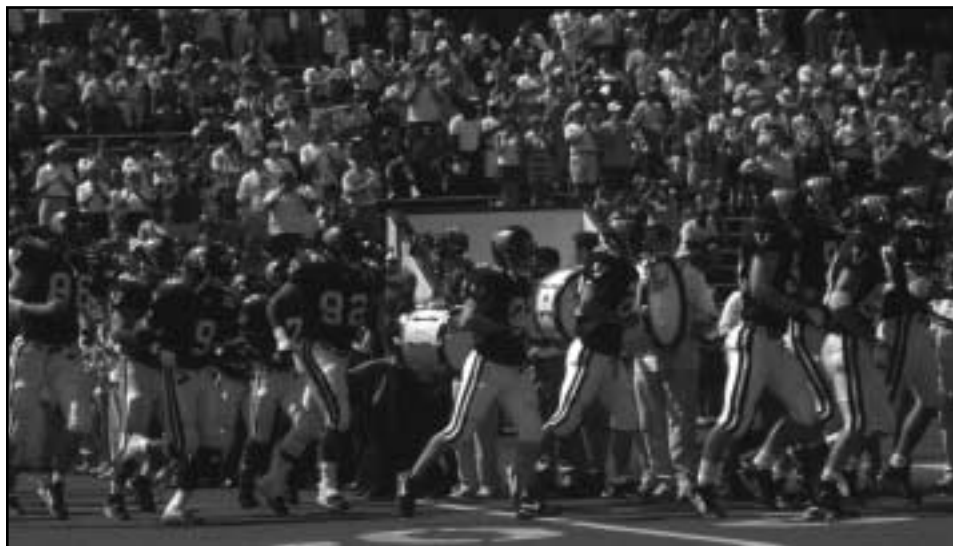
In the opening game of the 1997 season, Villanova scored a school-record 64 points in the first half versus West Chester.