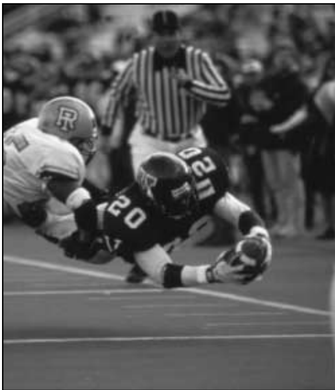
Brian Westbrook established 17 Villanova rushing records during his Wildcat career.