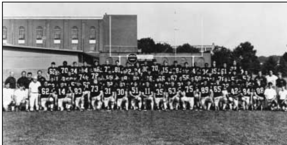
Despite committing a school-record 19 penalties versus Holy Cross, the 1970 Wildcat squad managed to defeat the Crusaders, 34-14, in a game played at Villanova Stadium.

Game — 0, several games, last occurred vs. Boston College, 10/12/68 Season — 311 (8 games), 1964 285 (5 games), 1985