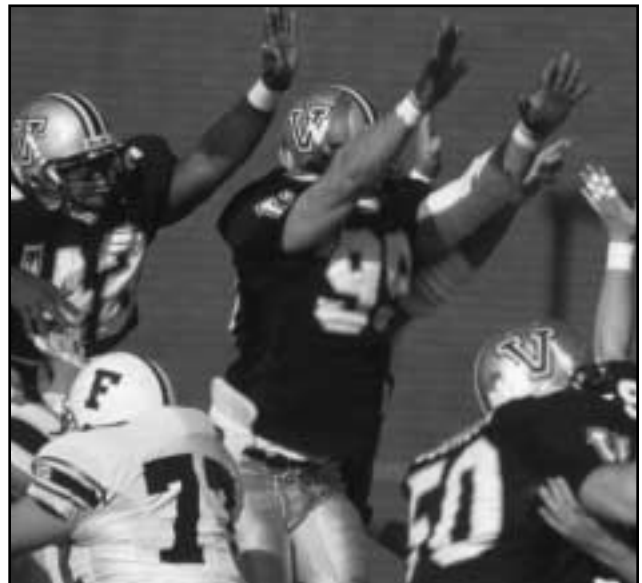
Villanova captured two Yankee Conference Championships during its nine-year membership in the league.