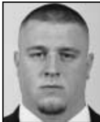
Michael Brigandi Center