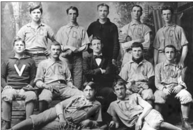
A Wildcat baseball team photo from the late 1800's - one of the earliest Villanova baseball teams.

Regular season titles: 1988 (South Division), 1993, 1996 (National Division title) Tournament titles: 1989, 1991