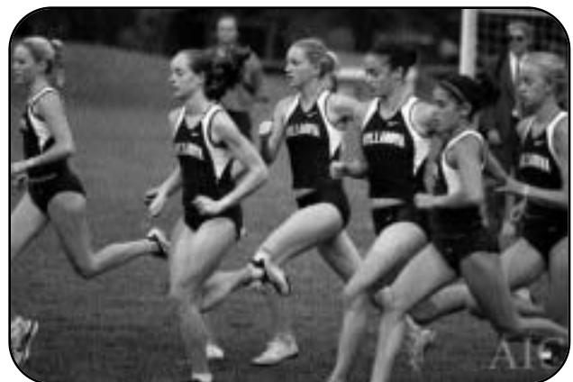
The Villanova women get off to a fast start at the Haverford College Invitational.