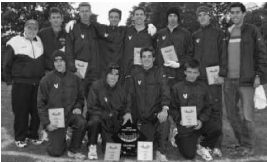
The 2002 Big East Cross Country Champions