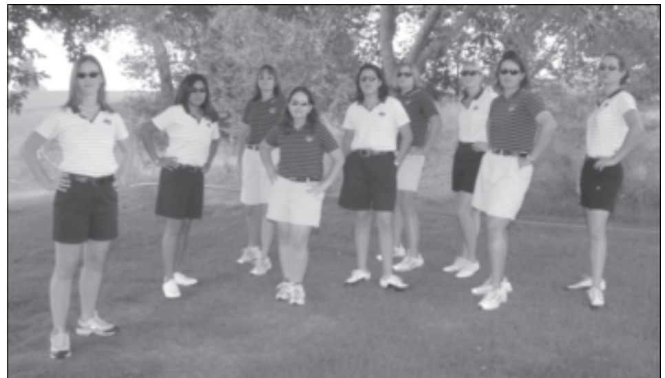
The 2004-05 New Mexico Lobos earned the program's 13th consecutive postseason appearance with a No. 3 seed in the NCAA Central Regional.