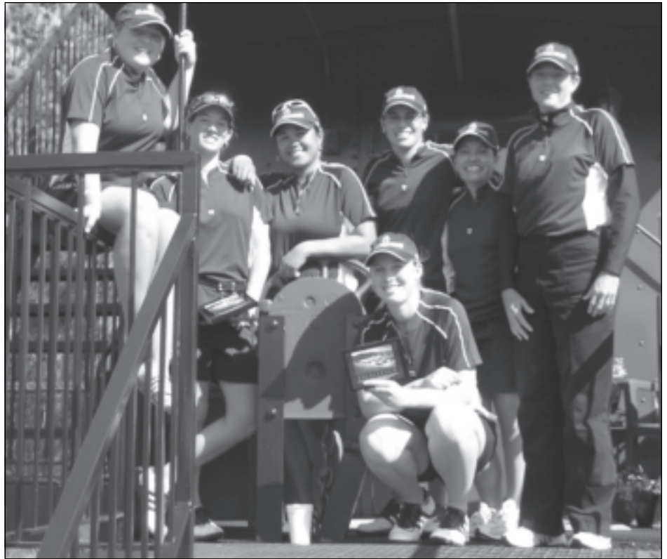
The Lobos won the Lady Gamecock Classic in March by 10 strokes over No. 20 Furman.

Although the Lobos fell short of their goal in making it to their second straight NCAA