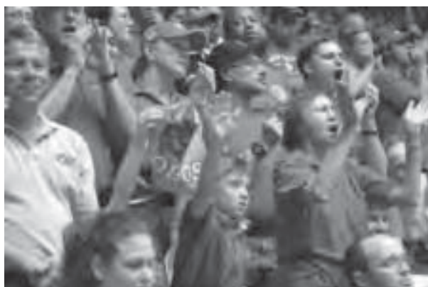
Fan support for the women's basketball team has continued to grow year after year.

For Lobo men's games, the crowd noise has been estimated at 125 decibels (the pain threshold is 130), and the women's games have begun to attract similar fanaticism. As a result, The Pit, which ironically sits at 5,200 feet elevation, but is located 37 feet underground, has earned the reputation as being "A Mile High and Louder Than..."