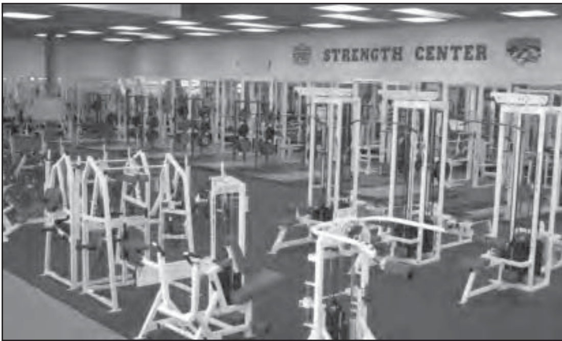
The L.F. "Tow" Diehm Athletics Facility is a 60,000-square-foot facility utilized by all of New Mexico's student-athletes. The weight room (above) is state-of-the-art and is considered one of the top training facilities in the country.

On the main campus of the university is Johnson Arena, home of Lobo volleyball, and Johnson Pool, site of UNM's home swim meets.