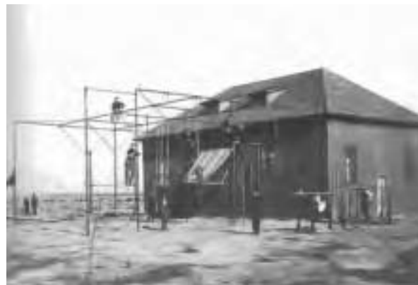
The original gym was constructed in 1895 for the amazing cost of $690. It measured 30'x50'. It was torn down in 1934.

Perhaps the most astounding aspect of The Pit is the people who fill it... the fans. The Lobo women's program sold a total of nine season tickets in 1994-95 and averaged an attendance of just under 400. In 1995-96, Don Flanagan's first season, UNM sold 1,467 season tickets and averaged 3,501 fans per game, the 21st-best figure in the nation. Support has increased exponentially since, and in 2000-01 the Lobos drew a school-record 182,961 fans in 21 home games, which was the third-highest total in the nation. In 2002-03 UNM averaged a school-record 11,896 fans per game, good for fourth nationally, which is the highest the Lobos have ever ranked in NCAA stats for per game averages. Last season New Mexico was ranked fourth nationally for the third consecutive season with an average of 10,684 including eight crowds of over 10,000 during the year, including 16,084 on Senior Day for the Lobos game