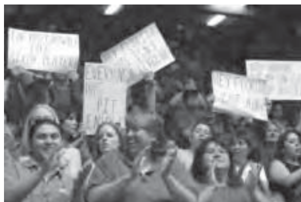
Women's basketball fans are a special breed and the Lobos are grateful for their support.