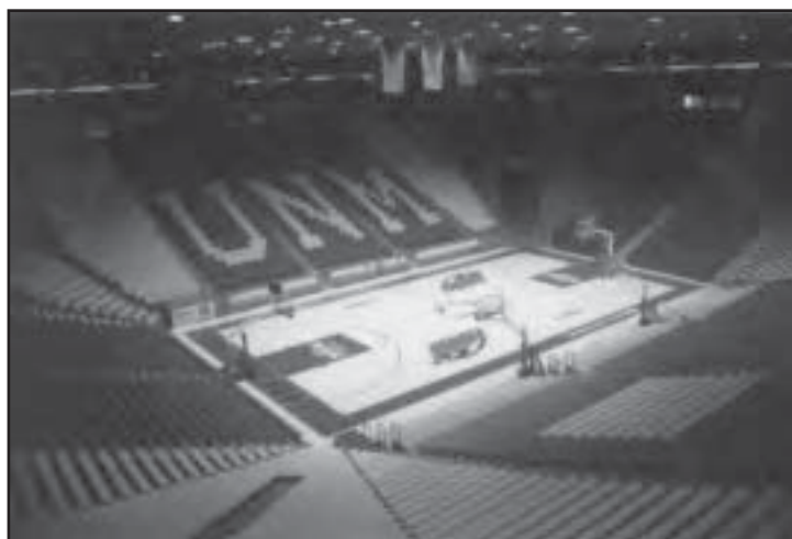
New Mexico's home floor was opened December 1, 1966. Since that date over 10 million people have witnessed basketball games at University Arena.