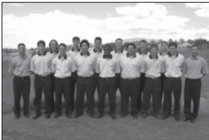
THE 2004-05 UNIVERSITY OF NEW MEXICO MEN'S GOLF TEAM IS ONE OF THE MOST SUCCESSFUL TEAMS IN UNM HISTORY. THIS TEAM WON A MWC CHAMPIONSHIP, FINISHED FIFTH AT THE NCAA CHAMPIONSHIPS AND POSTED A HEAD-TO-HEAD RECORD OF 184-30-2.

New Mexico over this time has won 14 tournaments including three Mountain West Conference titles. UNM has also produced six All-Americans. The Lobos have advanced to the NCAA Championships five times over the last six years, including a fifth place finish last season. In the last six years New Mexico has a head-to-head record of 880-389-21, which is a winning percentage of .682.