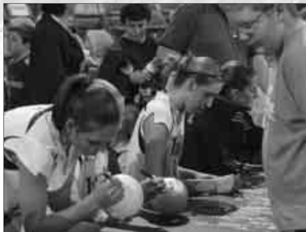
Members of the Irish Spikers club meet the team after each home match and receive autographs from Notre Dame players.

IRISH SPIKERS - Kids under the age of 14 have the opportunity to join the Irish Spikers, an official club sponsored by the Notre Dame volleyball team. Spikers get the opportunity to join the team on the court for match introductions,