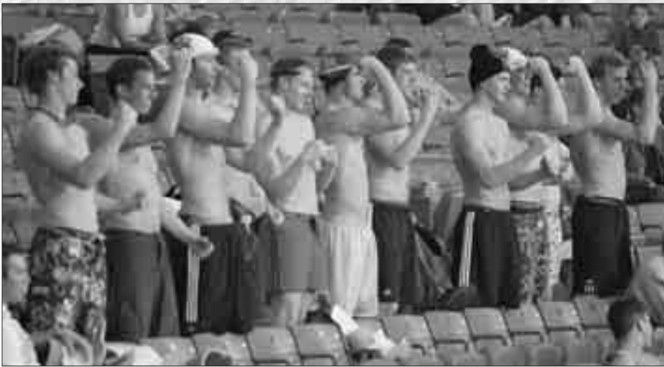
The Irish men's swimming and diving team is a strong supporter of Notre Dame volleyball. Members of the squad traditionally wear 31 articles of clothing to the matches and remove one each time the Irish score a point. When ND reaches 30 points (and wins the game), the swimmers and divers run around the Joyce Center cheering and doing pushups in only their swim trunks.