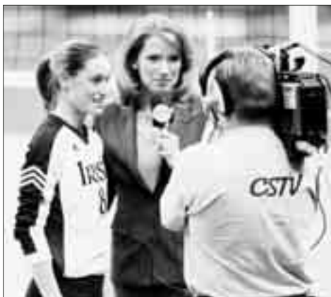
Notre Dame was featured on College Sports Television's "Sunday Night Spikes" in 2003, as the Irish defeated BIG EAST rival Miami 3-0 in front of a national television audience.

CSTV - In 2003, Notre Dame volleyball was featured in the inaugural year of programming on College Sports Television (CSTV). The Irish beat league rival Miami in front of a record crowd of 2,715 as part of the AVCA's Sunday Night Spikes series of weekly volleyball matches. Notre Dame volleyball will make its second live appearance on CSTV this season, as its match against host South Carolina in the Gamecock Invitational on Sunday, Sept. 19 at 2 p.m. (EDT) will be televised for a national audience. For more information about CSTV, see www.cstv.com .