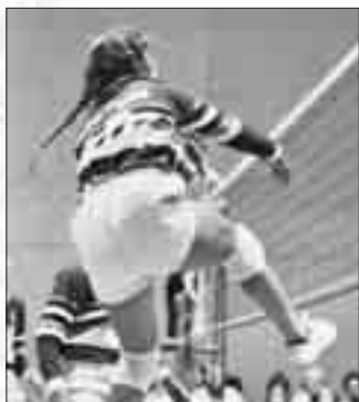
Action from the first varsity season.