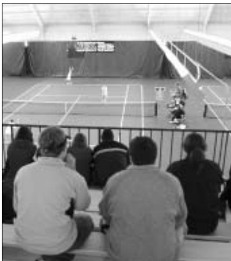
The Irish faithful showed up in force for the 2003 Ace for the Cure, in which Notre Dame upset #13 Texas 5-2 in the Eck Tennis Pavilion.