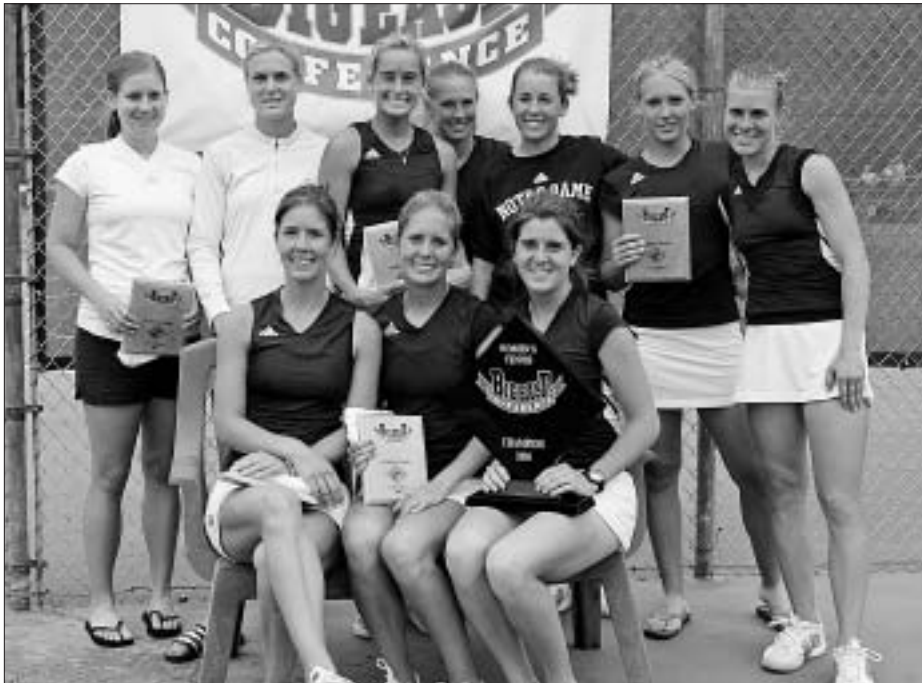
Notre Dame swept its way to its sixth BIG EAST championship in 2005, defeating St. John's and Syracuse both by 4-0 scores in Tampa, Fla.