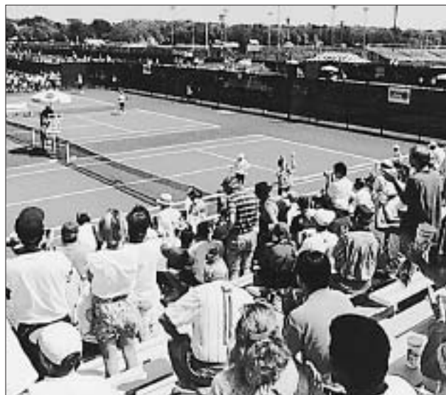
The Courtney Tennis Center has played host to NCAA Championship action 11 times, including serving as the national site of the 1998 NCAA Championships.

Since opening in 1967, the Courtney Tennis Center has undergone a variety of improvements. Most recently, 14 of the courts were newly resurfaced during the summer of 2003 and the facility was reoriented in the winter of 2004 as construction began on the neighboring Guglielmino Family Athletics Center. That undertaking saw the construction of a new tournament center tower, while the seating was moved from the west to the east end, which now plays host to varsity matches, making it more convenient for the teams