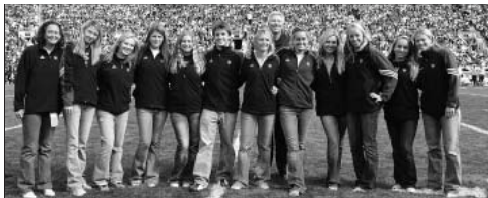
The Notre Dame women's tennis team was honored for its accomplishments during the 2005-06 season - which included winning a seventh BIG EAST Conference championship and earning its 13th NCAA tournament bid in the last 14 years - at the Irish football game against Penn State in front of a crowd of 80,795.

Printing by Ave Maria Press in Notre Dame, Ind.