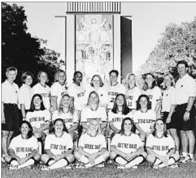
The 2001 Notre Dame softball team posted a national-best 33-game winning-streak on the way to a school record 54 wins and a ranking as high as eighth in the country.