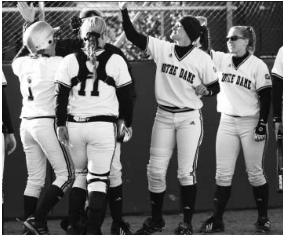
Notre Dame will play 22 home games, including visits from Pittsburgh, Louisville and 2006 College World Series participant Northwestern.