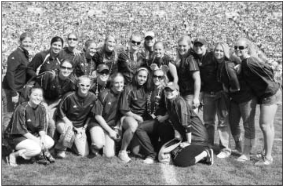
The 2006-07 Notre Dame softball team was recognized on the field during the Penn State football game for winning the 2006 BIG EAST Championship.