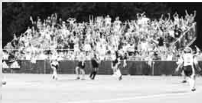
The Notre Dame women's soccer teams have played at Alumni Field since 1990. Located in the southeast corner of campus, it is one of the finest collegiate soccer venues in the Midwest with a seating capacity of 2,500. A press box was added in 1996.