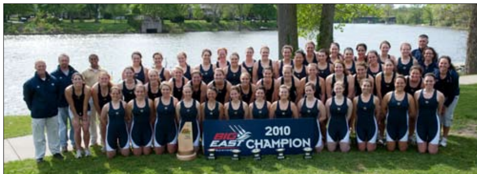
Notre Dame emerged victorious in five of six grand finals to stake claim to its seventh consecutive BIG EAST title in 2010, a feat that earned the Irish coaching staff BIG EAST Staff of the Year honors for the fourth time in five seasons.