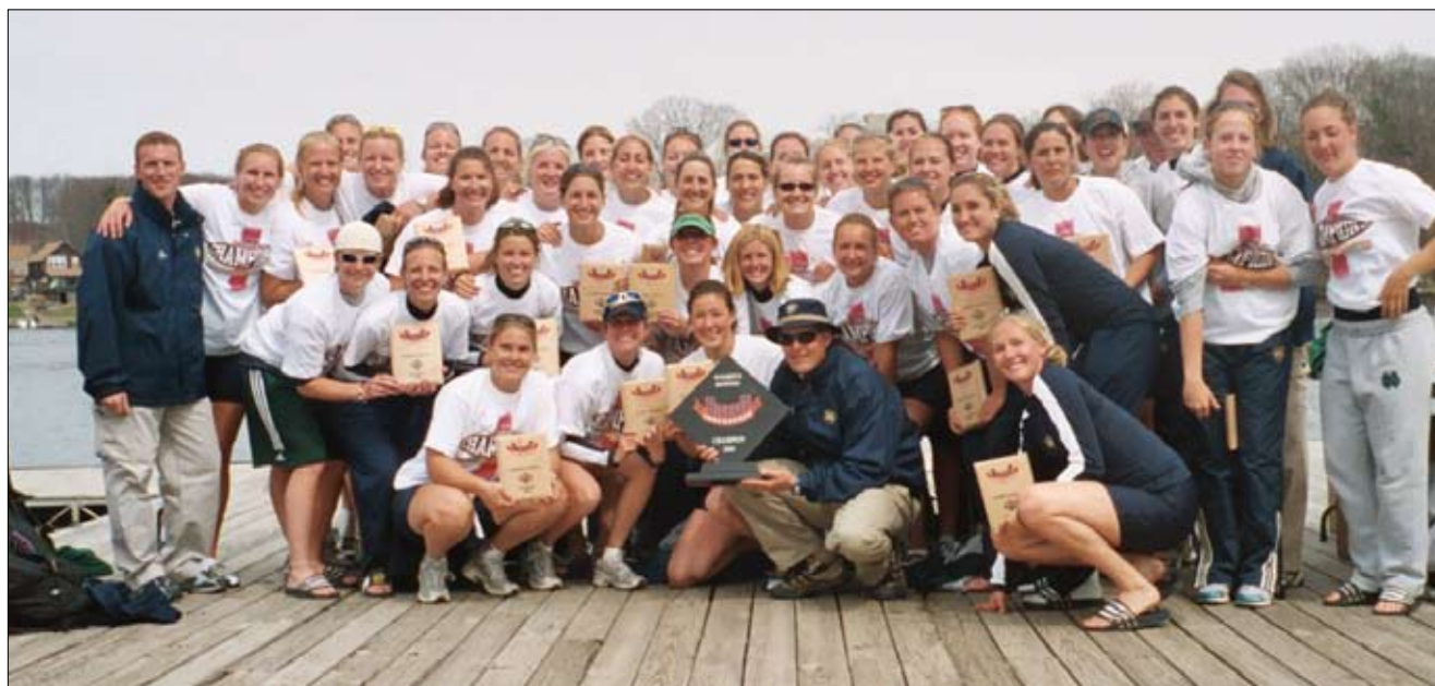
The 2004 season saw the Irish earn its first team title at the BIG EAST Championships after three runner-up results the previous three seasons, holding off Miami (Fla.) for the crown.