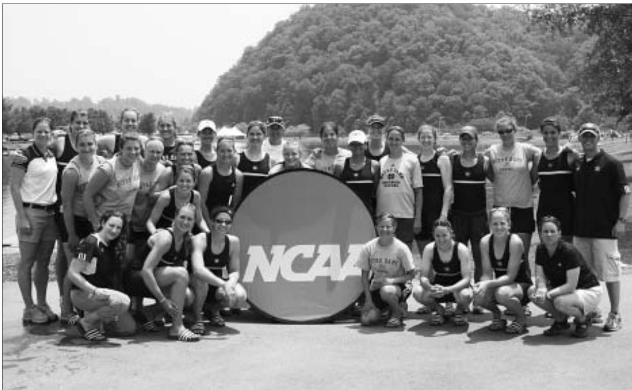
Notre Dame finished 12th at the NCAA Championships in 2007 after earning the program's second consecutive berth in the team competition.