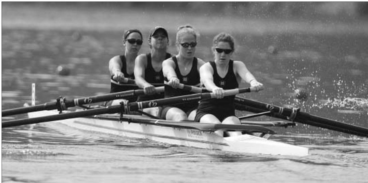
Notre Dame's varsity four crew won the gold medal at the BIG EAST Championships for the second consecutive year. The boat also placed 11th at the NCAA Championships for the second time in as many seasons.