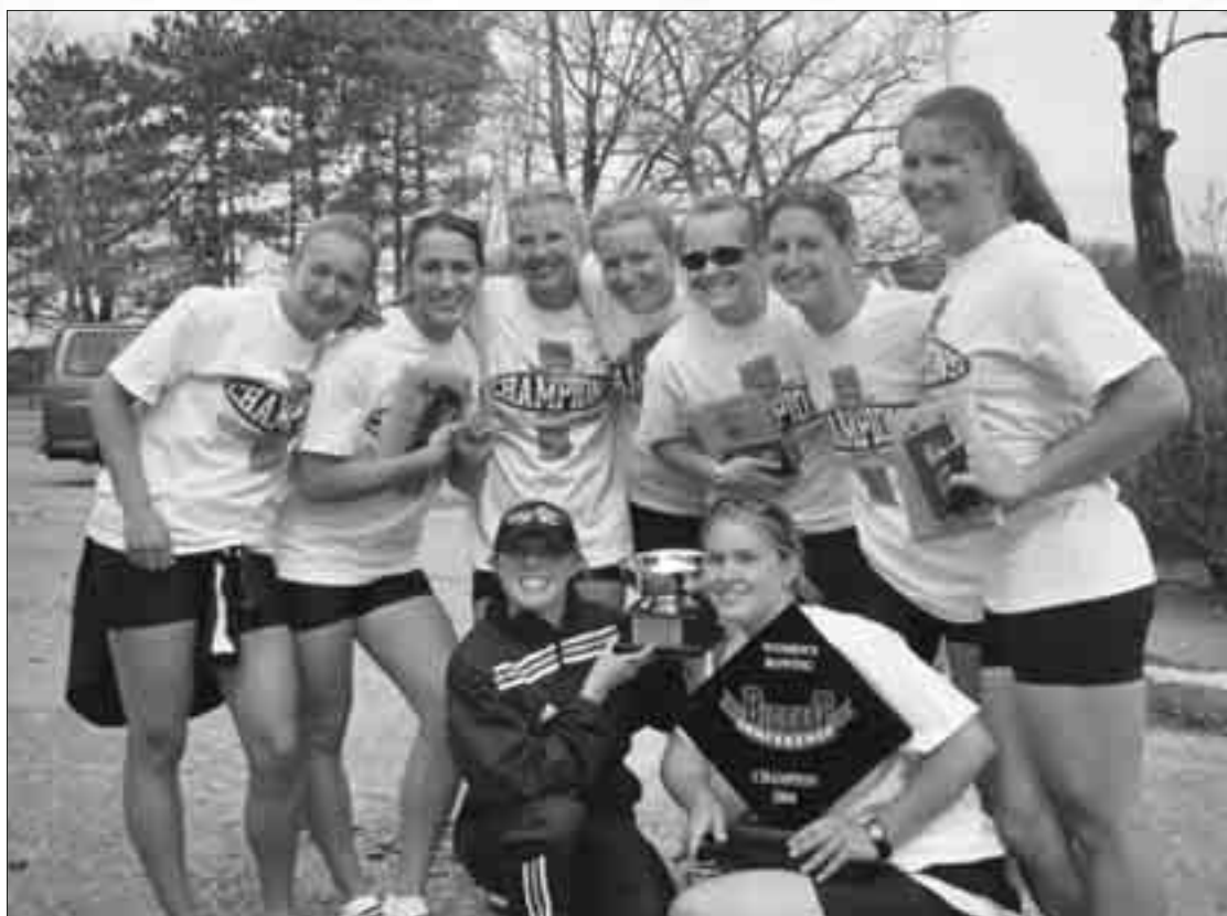
Notre Dame's Varsity Eight Crew