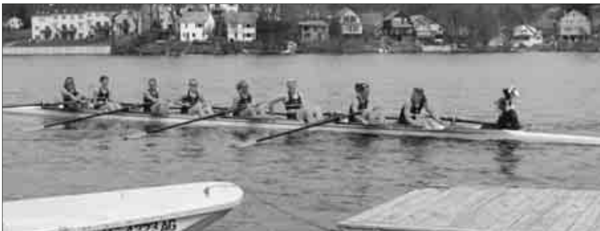
Notre Dame's varsity eight crew was victorious at the 2004 BIG EAST Championships. The Irish won the overall team title for the first time in school history.