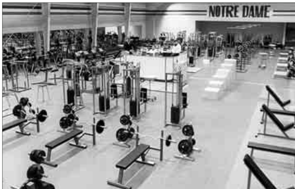
The Loftus Sports Complex houses one of the finest weight training facilities in the country.