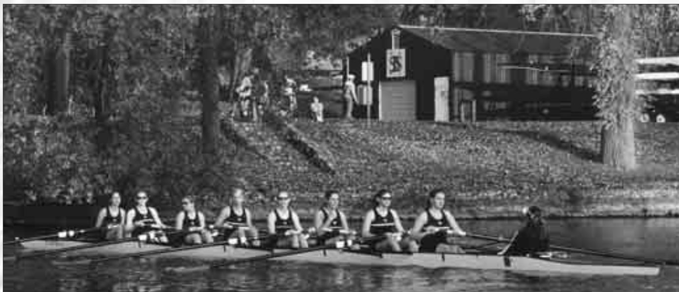
The Notre Dame women's rowing team trains in the fall and spring on the waters of the St. Joseph River.

Although the weather can be somewhat challenging during the winter months, the University of Notre Dame and the Irish women's rowing team boast some of the nation's best athletic facilities. For most of the season, the Irish row on the St. Joseph River and for those times when they need to go indoors, they have full use of the Loftus Sports Complex and the soon-to-be completed Guglielmino Family Athletic Complex.