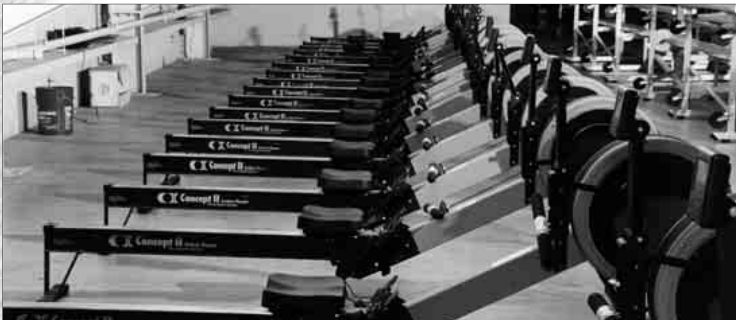
During the winter months, Notre Dame rowers have access to 32 rowing machines inside the Loftus Sports Complex.

The 2004-05 school year marks the 19th full year of use of the Loftus Sports Complex, including Meyo Field and the Haggar Fitness Complex, by Notre Dame's athletic teams. The all-purpose indoor sports building, which was first opened in September of 1987, and dedicated on April 23, 1988, was