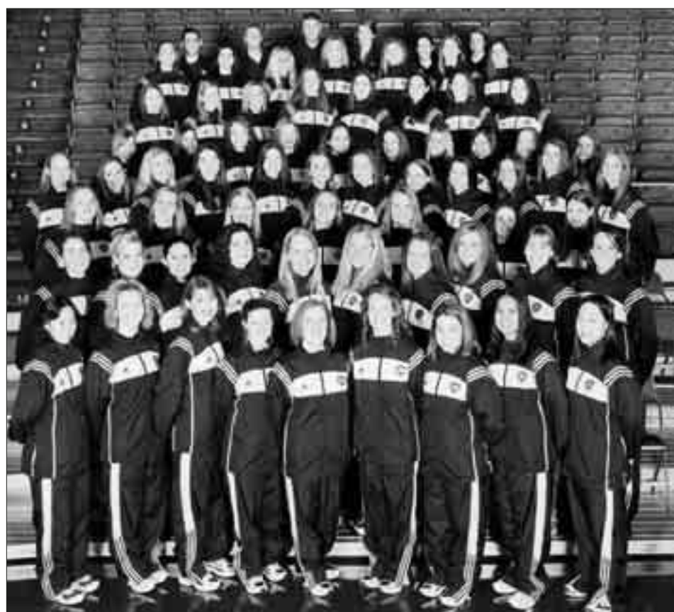
Rowing Photo: From Left to Right