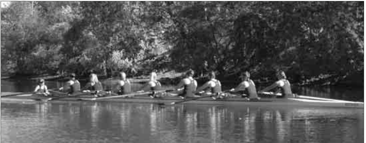
Notre Dame, defending BIG EAST champions, will be eyeing the program's first-ever team bid to the NCAA Championships in 2005.

Notre Dame is slated to once again travel to San Diego, Calif., for the San Diego Crew Classic. The Irish will look to defend their title at the BIG EAST Rowing Challenge in last April. The South/Central Regional Championships in Oak Ridge, Tenn., will once again be the team's most important competition of the season with an NCAA bid on the line. The NCAA Championships return to Sacramento, Calif., in 2005.