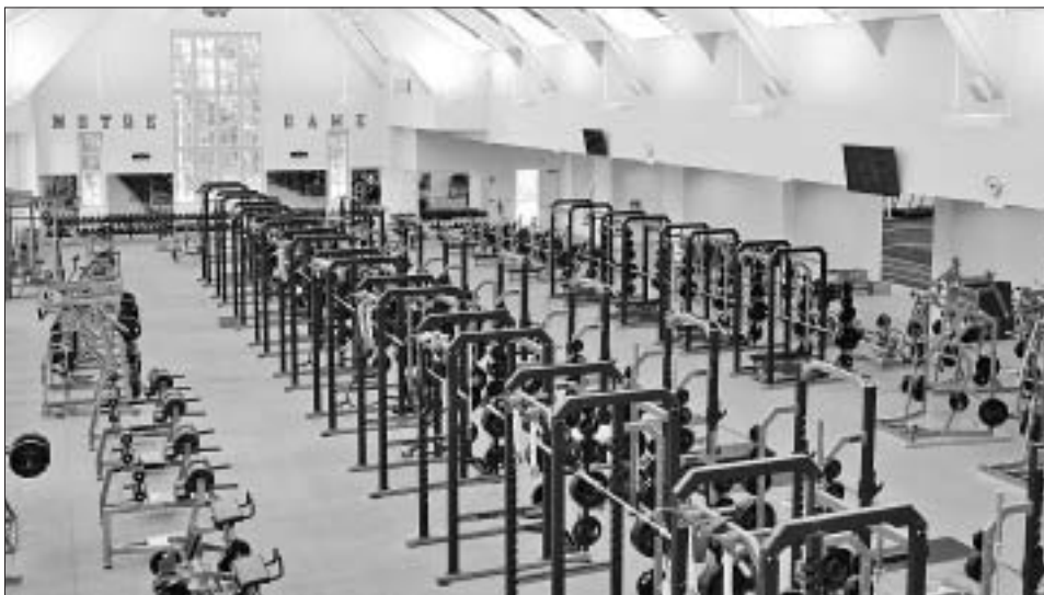
The Haggar Fitness Center, which is shared by both the Loftus Center and the Guglielmino Athletics Complex, features 25,000 square feet of strength and conditioning space with state-of-the-art weight equipment, a 50-yard Mondo track for speed training, a 45-yard by 18-yard Prestige Turf athletic surface for team workouts and an updated sound and lighting system that features six plasma television screens.