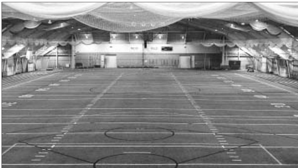
The Loftus Sports Center, one of the six indoor facilities in the country that plays host to Division I women's lacrosse games, is the home of the Notre Dame Fighting Irish women's games when inclement weather precludes them from being contested at Moose Krause Stadium.