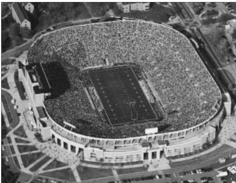
Notre Dame will play host to the 2008 BIG EAST Women's Lacrosse Championships on April 25 and 27. The semifinals and finals will be played at historic Notre Dame Stadium.