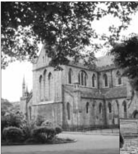
While in Dublin, the team toured historic St. Patrick's Cathedral.