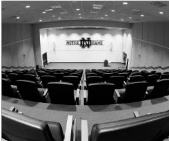
The Isban Auditorium within the new Guglielmino Athletics Complex provides an ideal setting for team meetings. The auditorium can seat up to 150 people in large chairback seats.