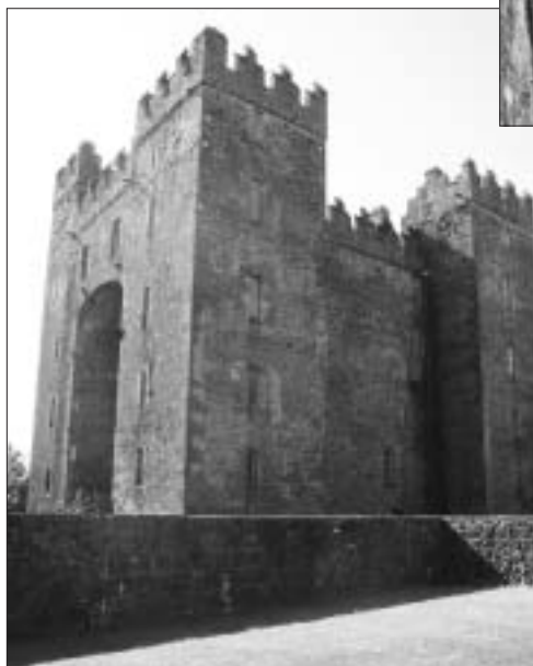
The Irish women's lacrosse team got their trip started with a tour of Bunratty Castle.