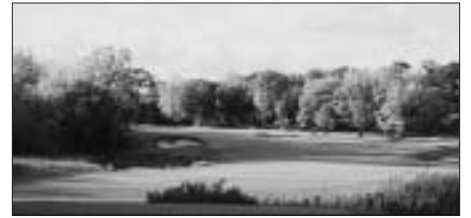
The elevated tee from the longest hole on the course, the 480-yard 17th hole, overlooks a pond to the left and the large bunkers in the bank of the hill, leading to a sharp dogleg-left approach to the green.