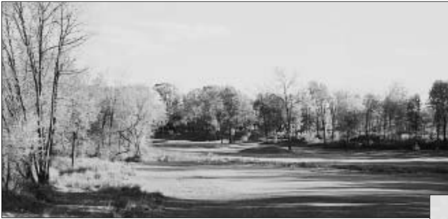
The finishing hole's tee shot (above) must carry the new stretch of Juday Creek and bend left to the green. The entire left side of the 18th fairway is bordered by the bed of the former Juday Creek, which has been filled to form a new stream.