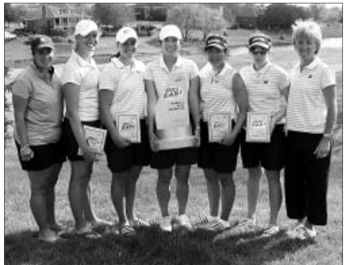
Notre Dame fell to Louisville by one shot on the first hole of a sudden-death playoff to earn a runner-up finish at the 2007 BIG EAST Championship. The Irish, who carded a season-best total of 891 (+27) at the tournament, tied a school record with four all-BIG EAST members.

(* – Louisville defeated Notre Dame by one shot on the first hole of a sudden-death playoff.)