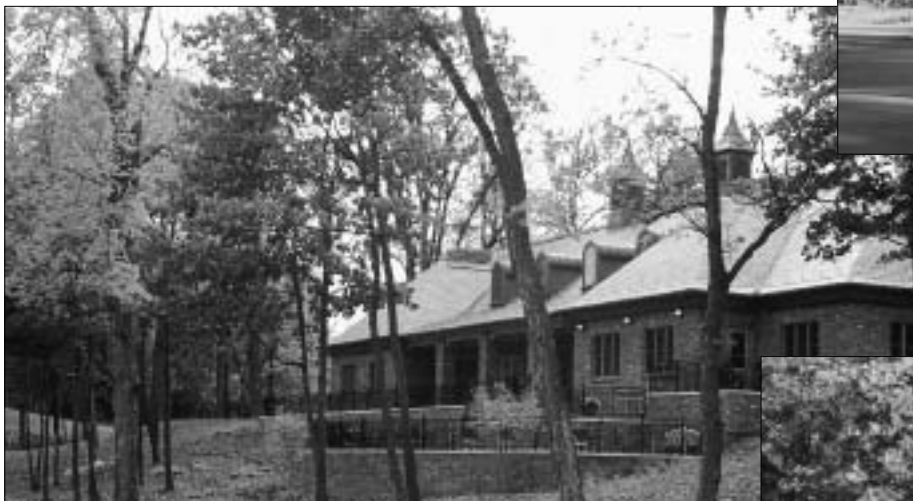
The eastside back porch of the clubhouse (above) overlooks the finishing holes and welcomes golfers from the nearby 18th green.