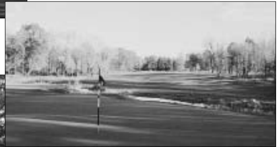
The 495-yard 10th hole is another long hole that a big hitter may try to reach in two. Watch out for the creek that runs diagonally across the entire width of the fairway in front of the green.