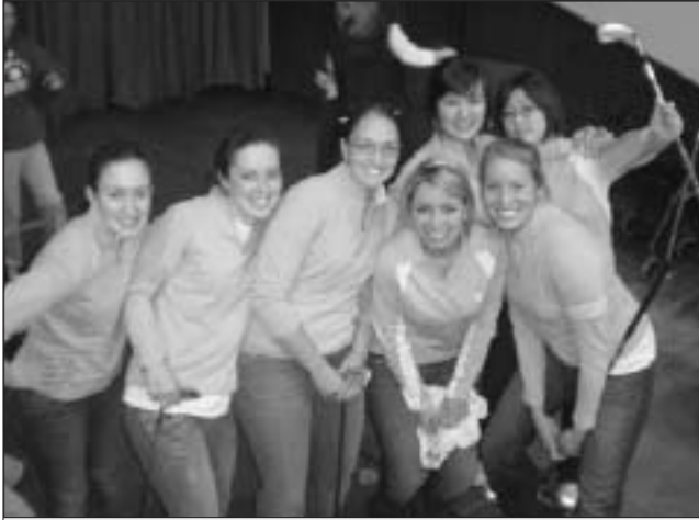
During a women's basketball game in the winter, the team took part in 'All Sports Night' where student-athletes from various Notre Dame teams showed off their skills in front of the Joyce Center crowd.