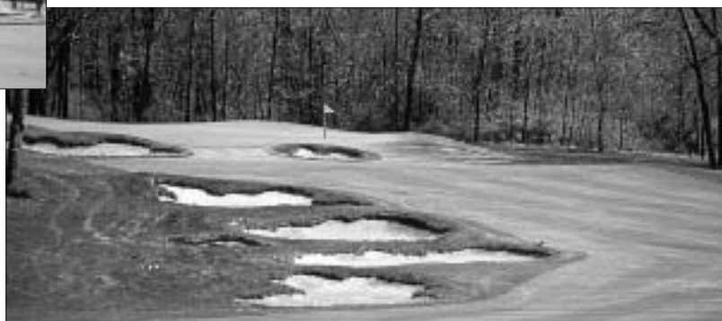
Above is a look from the picturesque tee at the 16th hole. Overlooking Juday Creek from the elevated tee, the hole ascends up and to the left to a tiny, undulating green that is very well protected by classic Coore- and Crenshaw-designed bunkers.