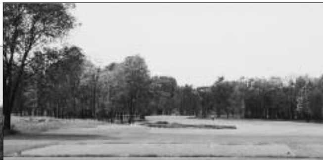
The fairway bunkers on the 216-yard 11th hole provide an architectural deception, in that – from the tee – the front bunkers appear to be located on the sides of the green when they, in fact, are 20 yards short of it (bunkers also are located on the sides of the green).