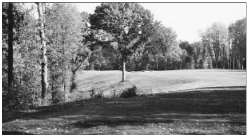
A picturesque view from the tee box greets golfers at the dogleg-left seventh hole (398 yards), with a solitary tree adding some danger down the left side of the fairway.