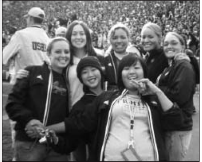
After being honored at a Notre Dame football game in the fall, the squad poses for a photo on the sidelines.