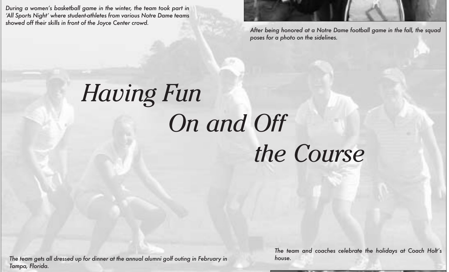
The team gets all dressed up for dinner at the annual alumni golf outing in February in Tampa, Florida.