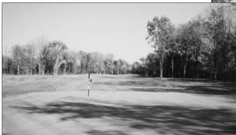
The view from behind the 414-yard eighth hole looks to a green that is rectangular in shape and slopes dramatically from the rear, with an open front that allows either a bump-and-run shot or one that is flown to the green.