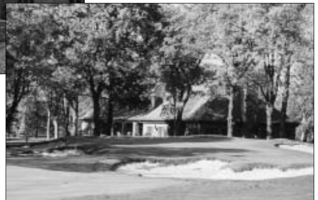
The westside entrance to the clubhouse sits beyond the ninth green, which is noted for its back-to-front slope and is surrounded by deceptive and treacherous bunkering.