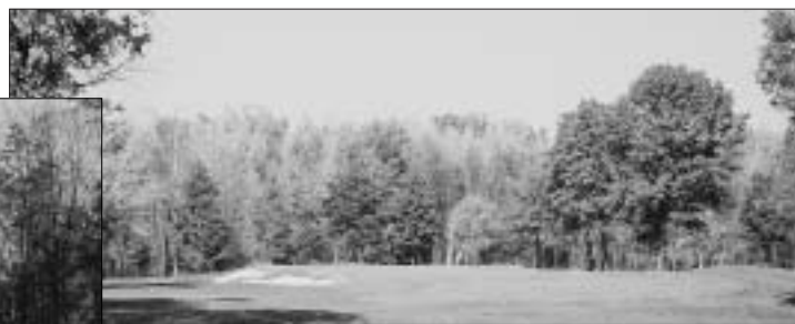
The 197-yard 14th is one of Ben Crenshaw's favorite holes on the Warren Golf Course. Noted for its old-Scottish style, the hole includes an elevated green and two bunkers to the right of the green that cannot be seen from the tee (unlike those to the left of the green). The hole is even more scenic when framed by full foliage in the surrounding trees.