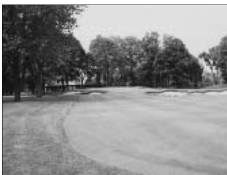
The ninth hole, as seen from one of the Warren Golf Course's distinctive rectangular tee boxes, is beautifully framed by trees, and the clubhouse is located behind the green.