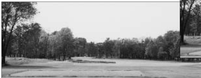
The northwest corner of the course showcases the green for the long, 443-yard second hole with the third tee in the distance. Douglas Road intersects with Juniper Road in the background.