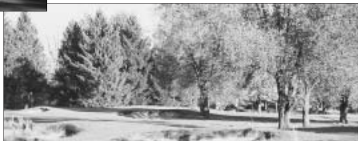
The 15th green is located just a stone's throw from the clubhouse, yet the building is obscured by a distinctive variety of trees that rim the putting green.