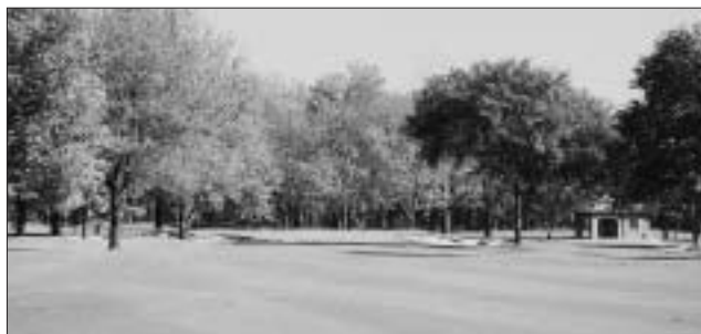
This is a look from the fairway of the 436-yard sixth hole. The green is guarded by two trees and has a narrow entrance that is protected by bunkers both left and right. The Starter's Cottage is visible in the right side of the picture.