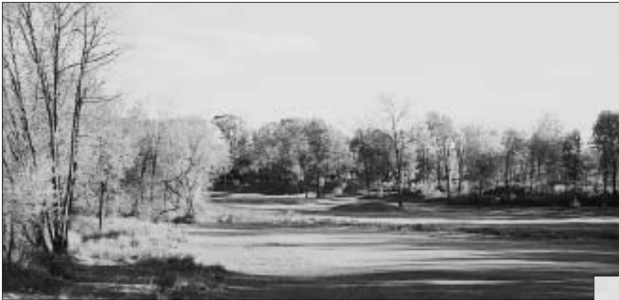
The finishing hole's tee shot (above) must carry the new stretch of Juday Creek and bend left to the green. The entire left side of the 18th fairway is bordered by the bed of the former Juday Creek, which has been filled to form a new stream.