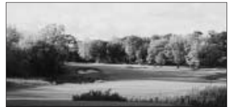
The elevated tee from the longest hole on the course, the 480-yard 17th hole, overlooks a pond to the left and the large bunkers in the bank of the hill, leading to a sharp dogleg-left approach to the green.