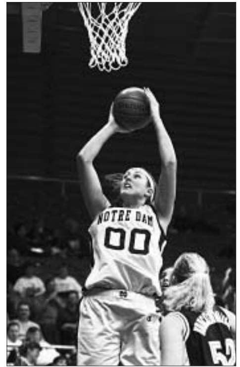
All-America center Ruth Riley posted the best single-season field goal percentage in school history, shooting .683 in 1998-99.