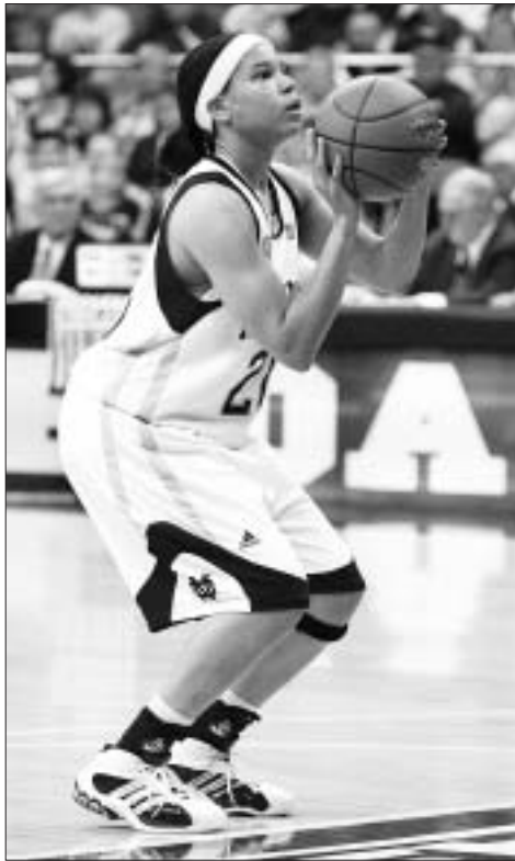
The Irish set a school record for free throw percentage in 2006-07, connecting at a BIG EAST-best .760 from the foul line.