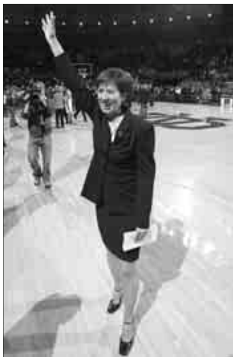
Irish head coach Muffet McGraw is poised to win her 400th game at Notre Dame later this season.