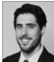
Dan Colleran Sports Information