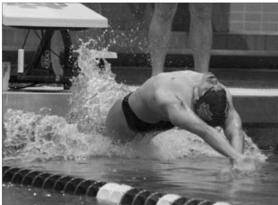
The Irish play host to six meets throughout the 2008-09 season.