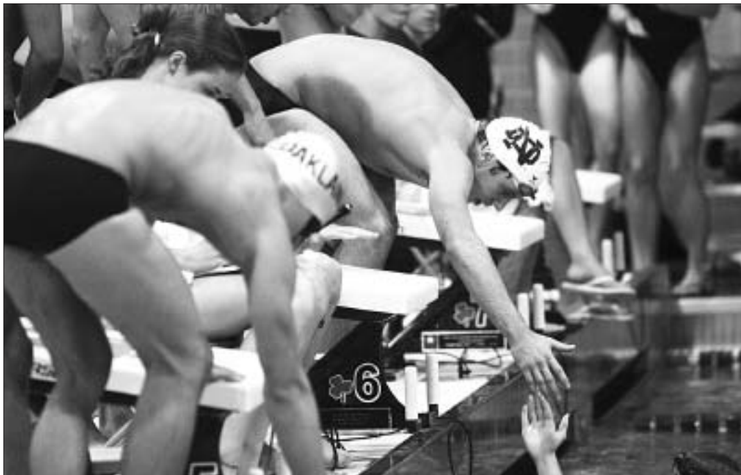
Seven school record holders on the swimming side and a pair of record-holding divers return for the 2007-08 season with the hopes of leading the Irish to their third BIG EAST crown since 2005.