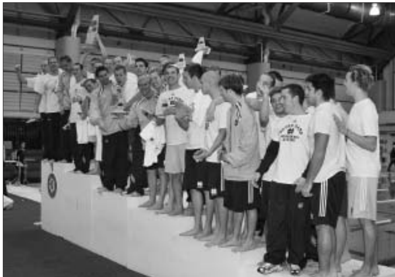
The Fighting Irish concluded the 2005-06 season just as they had the previous year, on the podium as champions of the BIG EAST Conference.

Close calls would be the story for Notre Dame's next two trips into the pool. For the second straight season the Notre Dame-University of Pittsburgh dual meet came down to the final event, the 400-yard freestyle relay. and for the second year in a row the Irish finished on top in the relay and the meet. Entering the final race, the Panthers held a 119-107 advantage but the Irish would go 1-2 and claim 15 of