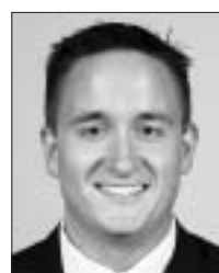
Sean Carroll Sports Information