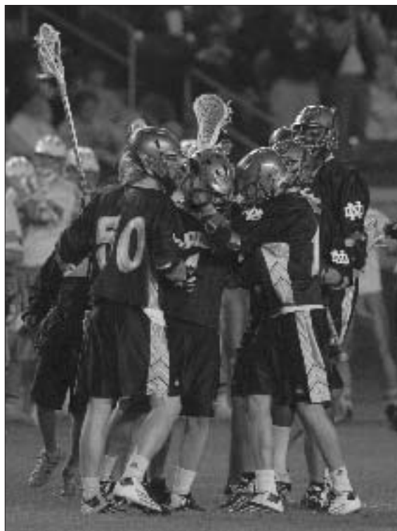
The Irish celebrate after capturing a 9-7 victory over No. 10 North Carolina in The First 4 Invitational in Carson, Calif.