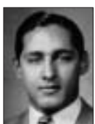
Jose Napoleon Duarte