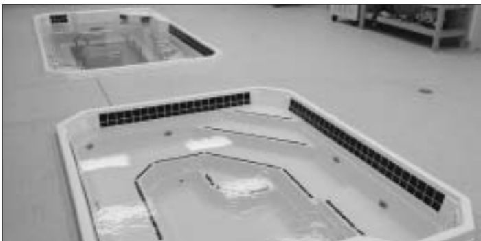
The Notre Dame athletic training staff has access to two whirlpool rehabilitation stations in the Guglielmino Athletics Complex.