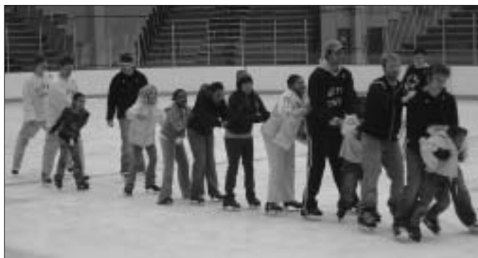
The Notre Dame hockey team annually holds a special skate day with children from the South Bend community.