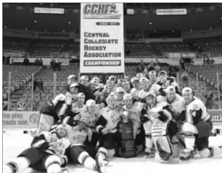
The Notre Dame hockey team won its first-ever CCHA regular-season and postseason tournament titles during 2006-07. The Irish (32-7-3) were ranked number one in the country for seven straight weeks from Feb. 5 through March 23.