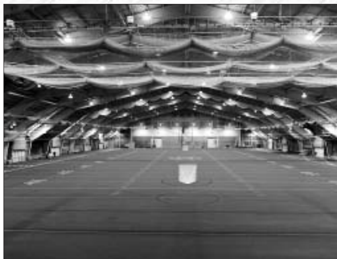
Meyo Field is the indoor training facility for the Irish lacrosse team.