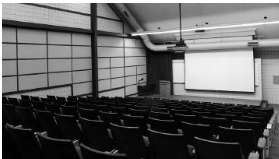
The 154-seat auditorium in the Loftus Sports Center provides an ideal setting for team meetings.