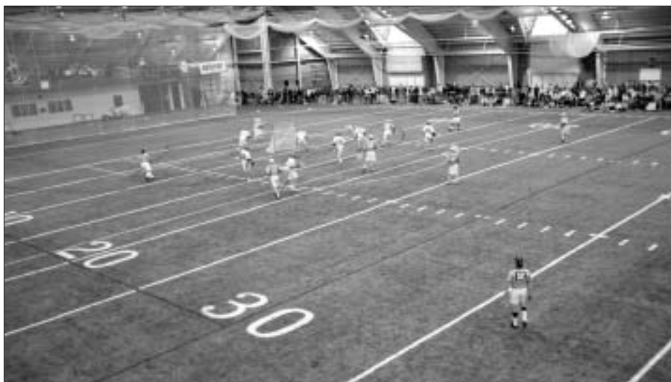
The Loftus Sports Center, one of the six indoor facilities in the country that plays host to Division I men's lacrosse games, is the site of Irish lacrosse games when inclement weather precludes them from being contested in Moose Krause Stadium.

played on the varsity basketball team in 1944, 1948 and 1949.