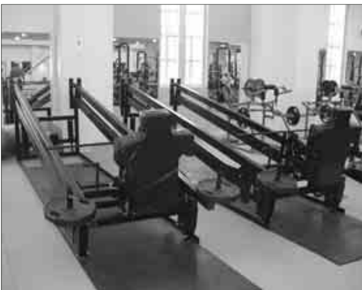
One of the eye-catching features of the Haggar Fitness Complex, a 25,000 square foot facility shared by the Guglielmino Athletics Complex and the Loftus Center, are two football variable weight sleds installed in the summer of 2005.

When entering the 25,000 square foot Haggar Fitness Complex (shared by the Loftus Sports Center and the Guglielmino Athletics Complex) student-athletes are quickly reminded of the 'roll up your sleeves' and 'get to