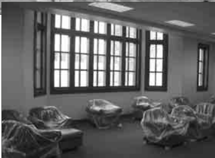
The players lounge