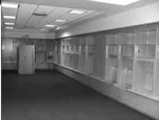
The Irish practice week locker room features 125 lockers and 22 showers.

Notre Dame's new practice week locker room features personal lockers for 125 players, each with a special cleat warmer/drier in the bottom section. The locker room is designed to be large enough for team gatherings in the middle and features 22 showers.