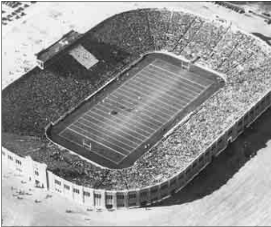
The dedication game of Notre Dame Stadium was played on Oct. 11, 1930, as the Irish posted a 26-2 win over Navy.

The Stadium measured a half-mile in circumference, stood 45 feet high and featured a glass-enclosed press box rising 60 feet above ground level and originally accommodating 264 writers plus facilities for photographers and radio and television broadcasters. There were more than 2,000,000 bricks in the original edifice, 400 tons of steel and 15,000 cubic yards of