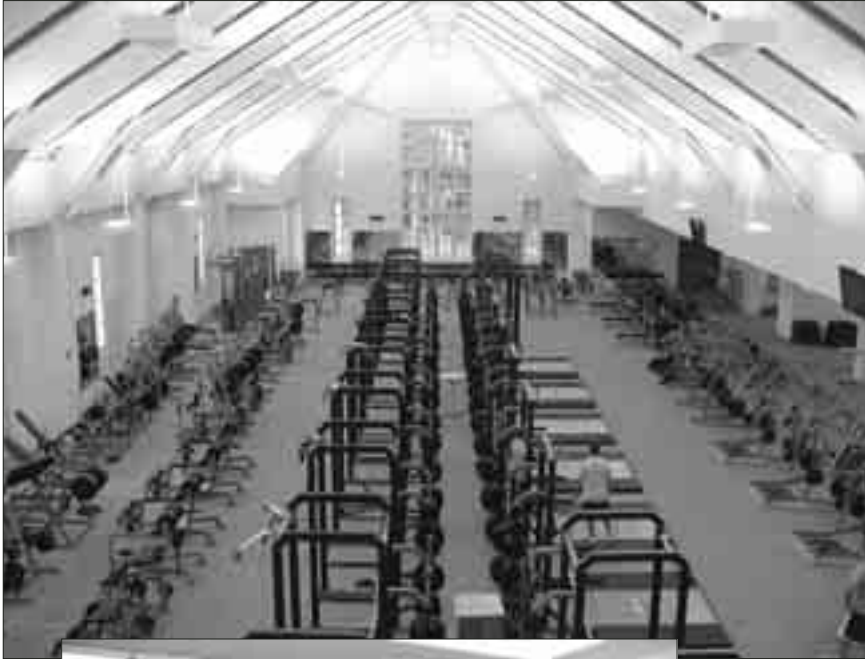
Haggar Fitness Complex