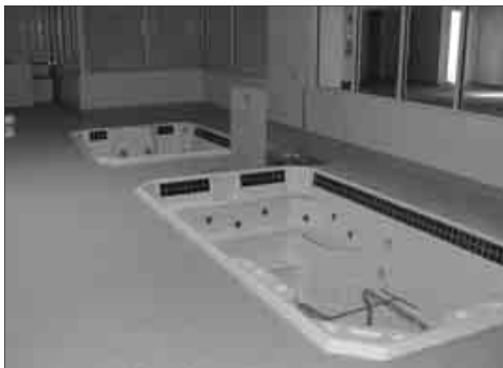
The Notre Dame athletic training staff will have access to two new whirlpool rehabilitation stations in the new Guglielmino Athletics Complex.

The Notre Dame student-athlete has access to three state-of-the-art sports medicine facilities, in addition to the 24-hour University Health Center. The original athletic training room is located in the Joyce Center. Notre Dame Football Stadium is home to the 3,300-square foot athletic training room, and the newest addition to the sports medicine department is located in the new Guglielmino Athletics Center. The facility opened in August of 2005 and is more than 8,500 square feet of cutting edge sports medicine technology. Through these facilities all student-athletes have access to the most modern sports medicine, including the latest in physical therapy modalities and rehabilitation equipment, which includes two 3,500-gallon therapy pools. A full x-ray unit and an MRI machine make up the majority of the department's diagnostic equipment.