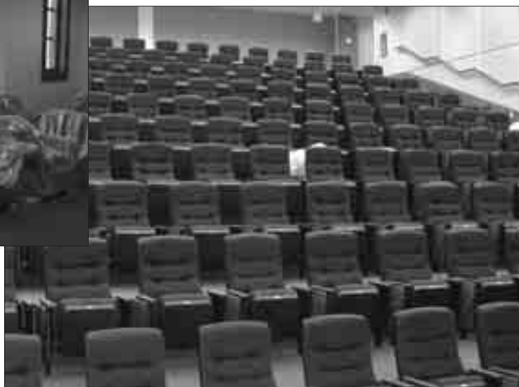
The auditorium seats 150 people in large chairback seats.

The University of Notre Dame is enjoying its first full season with access to the sparkling Guglielmino Athletics Complex, adjacent to the Loftus Sports Center on the east side of campus. Affectionately referred to as "The Gug" (pronounced Goog), the new building houses the football practice week locker rooms, coaches offices and meeting rooms in addition to enhanced sports medicine, strength and conditioning and weight room equipment areas for all 800 Notre Dame student-athletes.