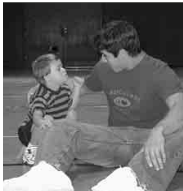
Junior quarterback Brady Quinn gets a laugh out of a new friend at one of the Student Development events in 2004-05.

The Department of Athletics Student Development Program, which has been in existence since 1996, continues to grow and evolve in an effort to meet the needs of student-athletes, so as to ensure that when they graduate from the University, they are prepared for another transition. It is the mission of the Student Development staff that all Notre Dame student-athletes are fully prepared to successfully meet the challenges of life.