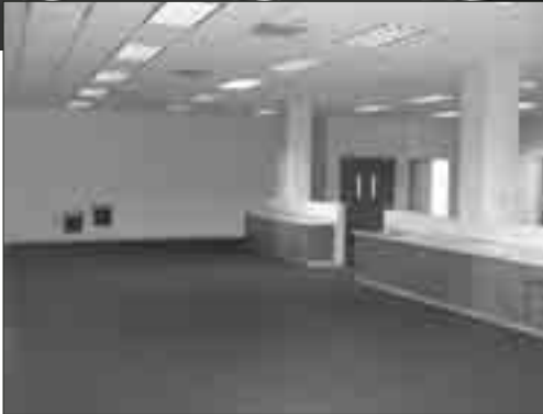
Athletic training center

The aforementioned mural is just one of several graphic presentations in The Gug. Along with the stunning two-story mural, there will be trophy cases honoring Notre Dame's national championships, Heisman Trophy winners, All-Americans, walk-ons and all-pros in the NFL.