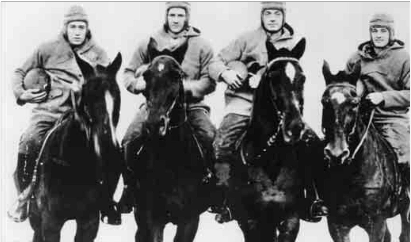
The Four Horsemen — Don Miller, Elmer Layden, Jim Crowley and Harry Stuhldreher

All four players eventually were elected to the National Football Foundation Hall of Fame — Layden in 1951, Stuhldreher in 1958, Crowley in 1966 and Miller in 1970.