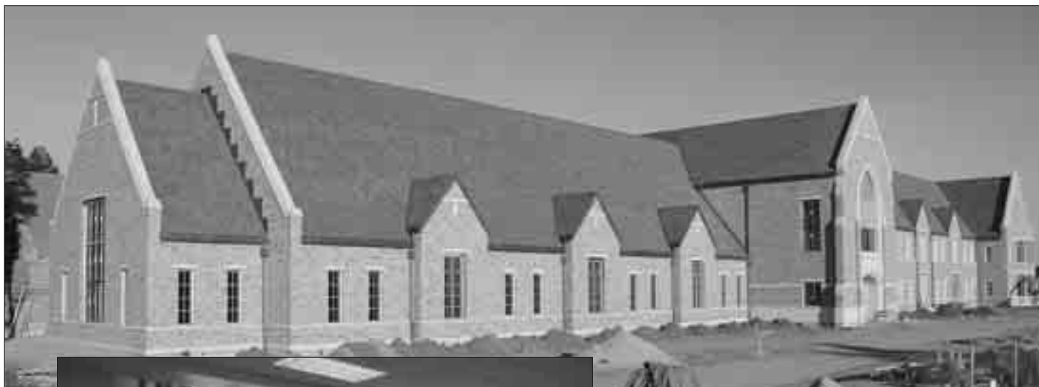
The Guglielmino Athletics Complex