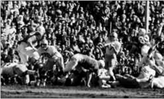
Quarterback Joe Theismann (7) holds the Notre Dame career bowl game record with 477 total offensive yards and a .605 completion percentage. Theismann played in both the '70 and '71 Cotton Bowl.