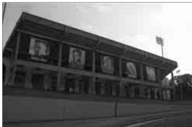
A large banner of former Notre Dame player Joe Montana (above) — along with banners depicting fellow 2000 inductees Howie Long, Ronnie Lott, Dan Rooney and Dave Wilson—adorned the exterior of the football stadium at the Professional Football Hall of Fame in anticipation of the July 2000 ceremonies. Eight other former Irish players are enshrined in the Hall, including former greats Curly Lambeau (top photo) and George Connor (left).