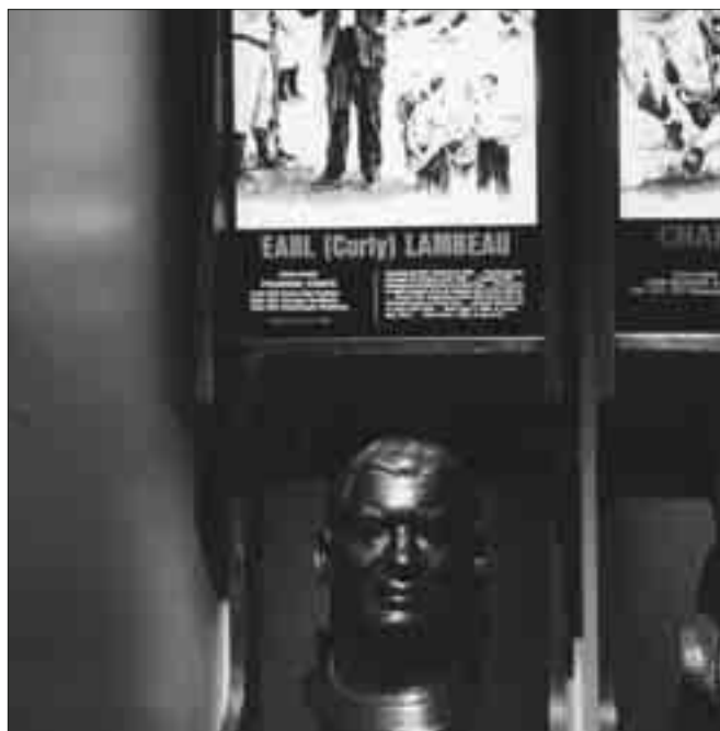
A complete list of the former Notre Dame players inducted into the Pro Football Hall of Fame in Canton, Ohio, by year of induction (year(s) played at Notre Dame):

Some of the greatest names in professional football have appeared on the gridiron wearing a Notre Dame football jersey. Curly Lambeau was a charter member of the Hall in 1963 as a founder, player and coach for the Green Bay Packers from 1919-1949. Lambeau lettered for the 1918 Notre Dame football team. Montana, who is among those mentioned as the greatest quarterbacks to play the game, won a National Championship at Notre Dame in 1977 and four Super Bowl titles with the San Francisco 49ers. One of Notre Dame's seven Heisman Trophy winners, Paul Hornung, was inducted into the Hall in 1986 and 1988 welcomed "Purple People Eater" and Minnesota Supreme Court Justice Alan Page (Minnesota 1967-78, Chicago 1978-81) into the Hall of Fame.