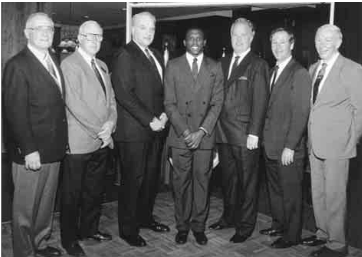
Notre Dame's seven Heisman Trophy winners gathered in December '87 in New York the night before Tim Brown was presented with his award. The Irish honorees are (from left) John Lujack, 1947; Angelo Bertelli, 1943; Leon Hart, 1949; Tim Brown, 1987; Paul Hornung, 1956; John Huarte, 1964 and John Lattner, 1953.

Brown burst onto the scene as a junior with a scintillating season-ending performance in a come-from-behind upset of USC, then used back-to-back punt returns for touchdowns in an early-season '87 game against Michigan State to cement his Heisman bid. Listed as a flanker, Brown utilized his ability as a pass receiver, rusher out of a full-house backfield and punt and kickoff returner to rank third nationally in all-purpose yardage as a junior (176.5 per game) and sixth as a senior (167.9). He finished his junior campaign with 254 all-purpose yards in the 38-37 win at USC (including a 56-yard punt return that set up the winning field goal), then returned punts for 66 and 71 yards for a pair of touchdowns in an early romp over eventual Big Ten and Rose Bowl champion Michigan State. Brown finished his career as Notre Dame's all-time leader in pass reception yards (2493) while also returning six kicks for touchdowns (three punts, three kickoffs). Despite constant double and triple coverage as a senior, he earned a reputation as the most dangerous player in college football. Brown was a first-round pick of the Los Angeles Raiders (sixth player chosen overall) in the '88 NFL draft. He has been selected to play in the NFL Pro Bowl following the seasons of 1988, '91, '93, '94, '95, '96 and '97, '99, 2000, 2001 and 2002. He also played in his first Super Bowl in 2003.